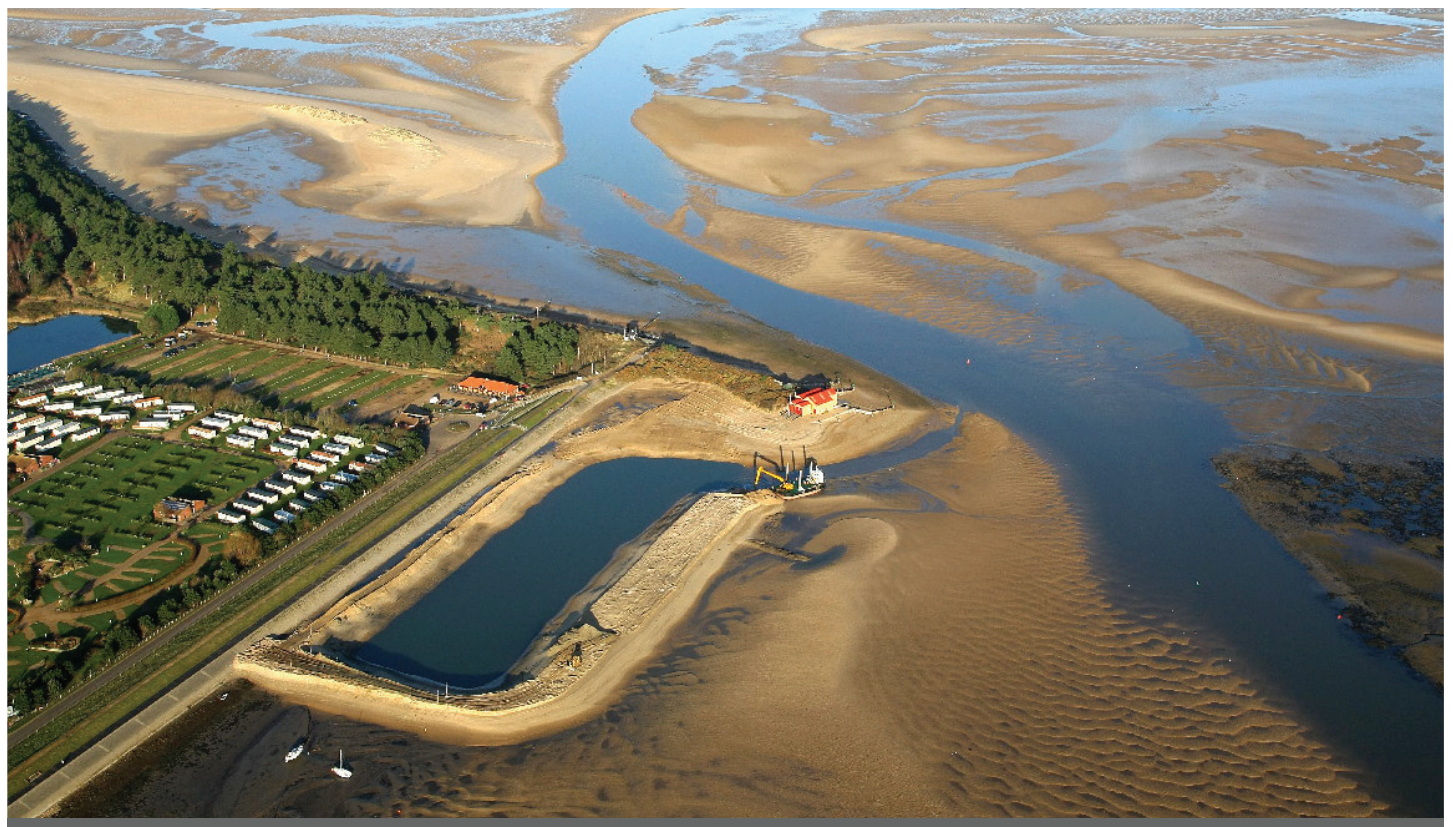
al of the dredger "Kari Hege" in operation at Wells.

For further information about the Wells Harbour channel-deepening project, please contact the project owners, Wells Harbour Commissioners at harbouroffice@wellsharbour.co.uk.